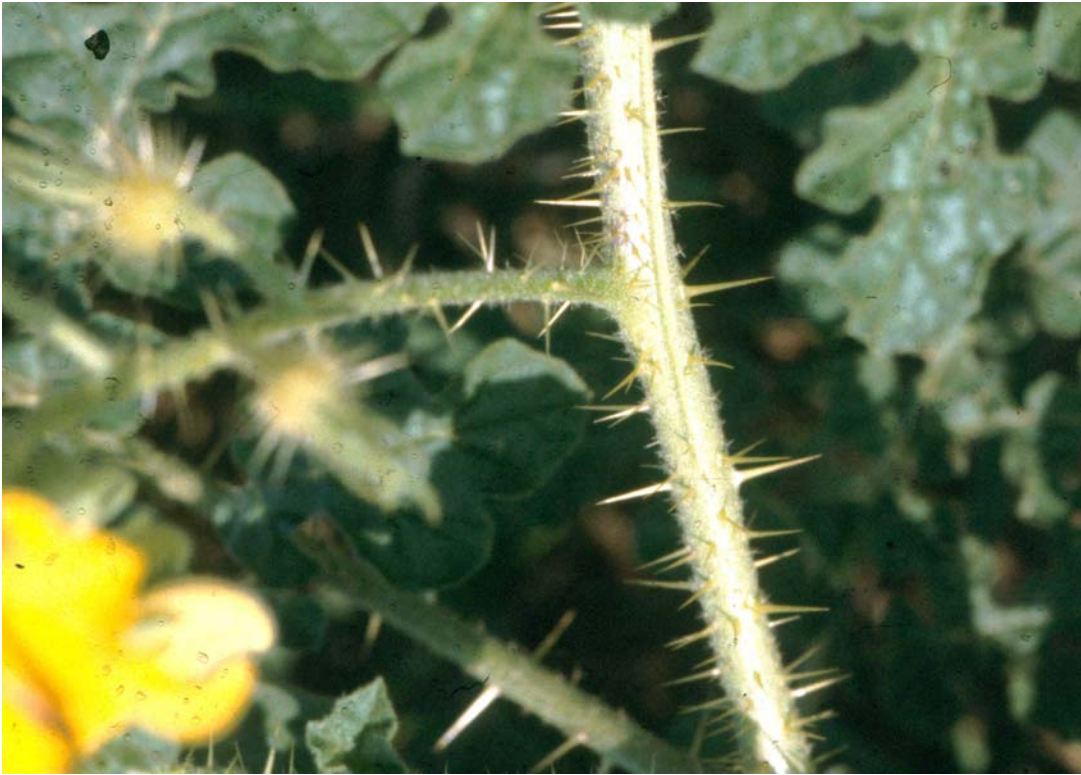
Stems. Note the stiff spines.