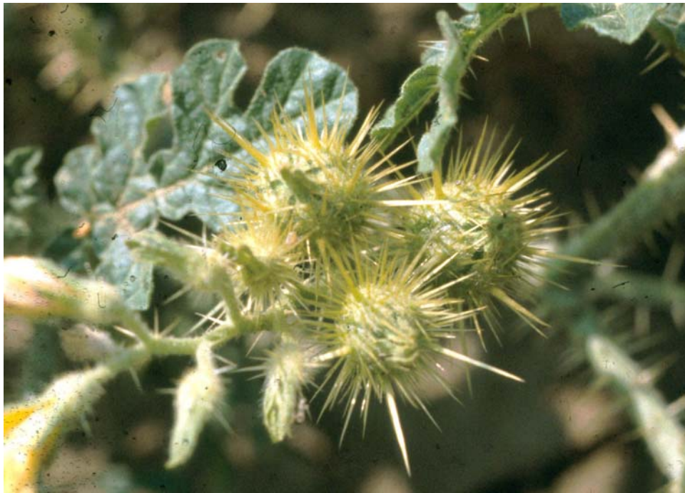
Fruit. Armed with stiff, yellow spines.