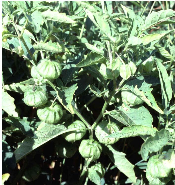
Fruit is "hot-air balloon-like" in shape.