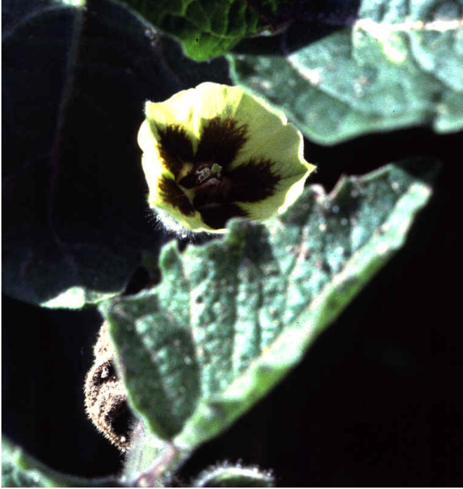
Flowers are yellow with purple centers.