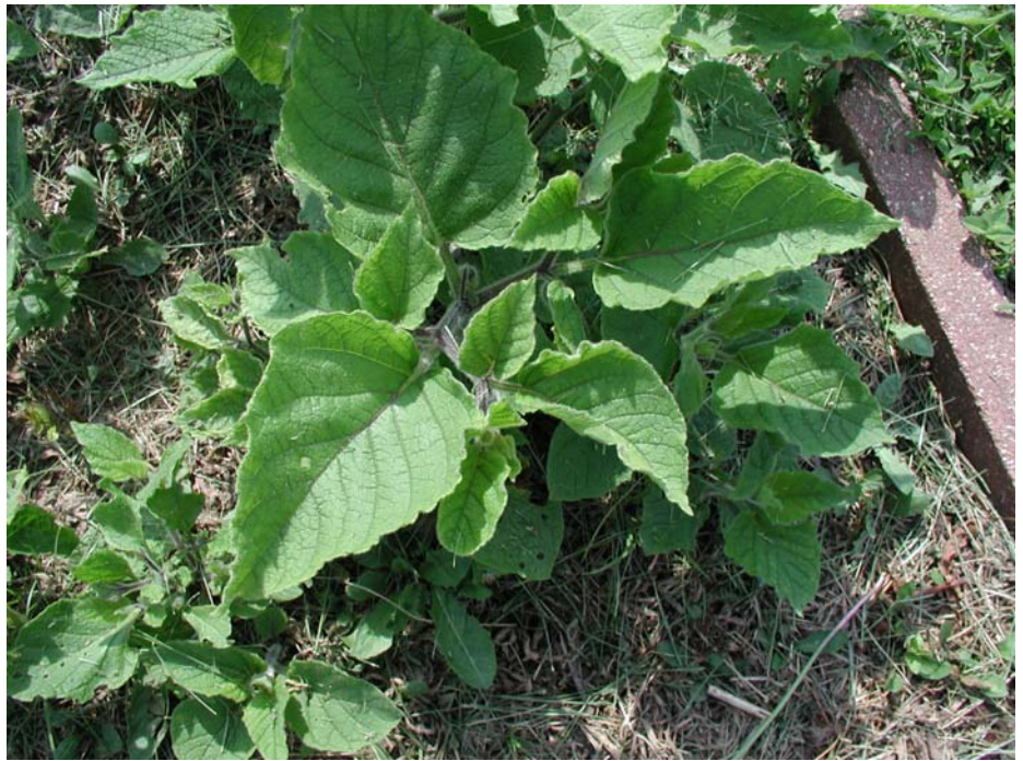
Closeup of foliage. Leaf margins have irregular teeth.