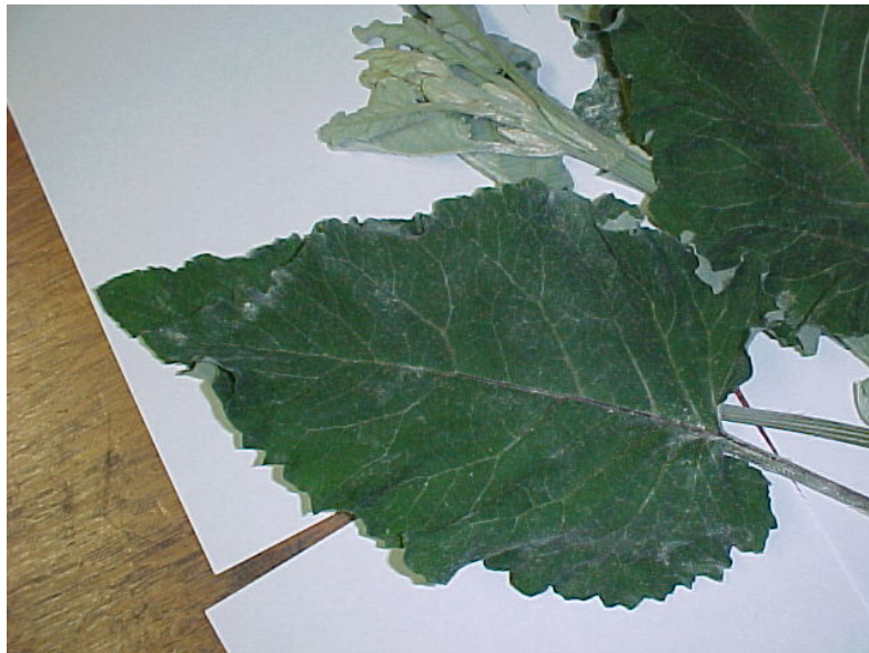
Leaves are very large with wavy margins.