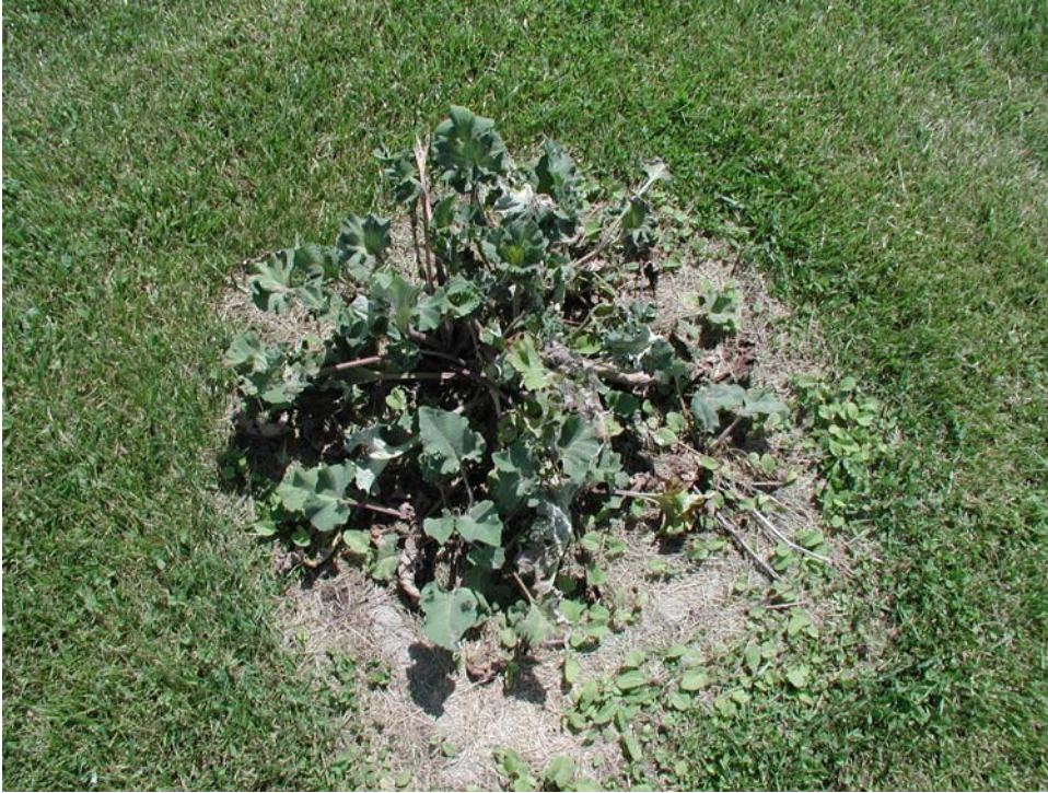
Flowering plant. Key characteristics: erect-growing; flowers are purple and have a "velcro-like" texture.