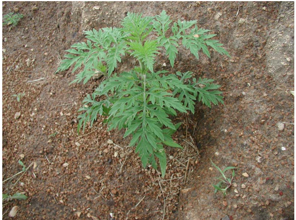
Foliage. Key characteristics: leaves occur oppositely until about the fourth node, are deeply cut and covered with hair.