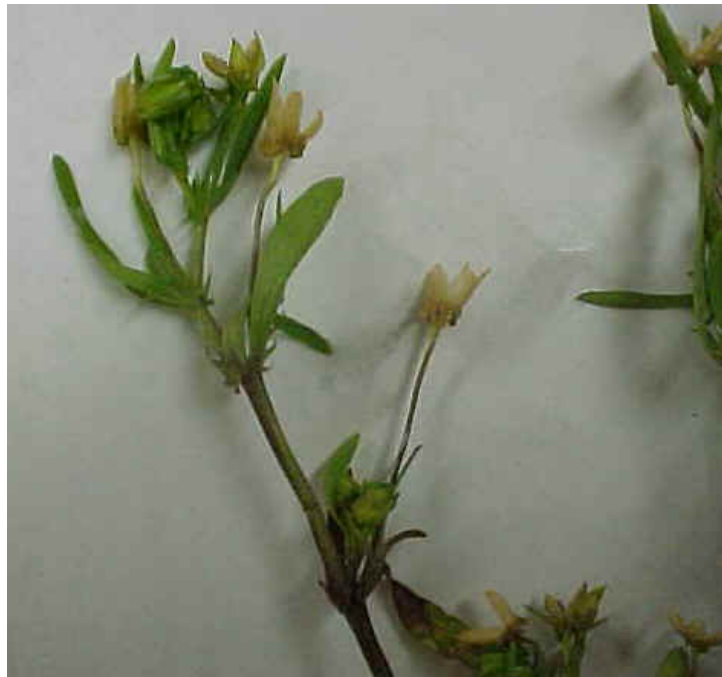
Flowering plants. Flowers are creamy-white and occur in leaf axils.