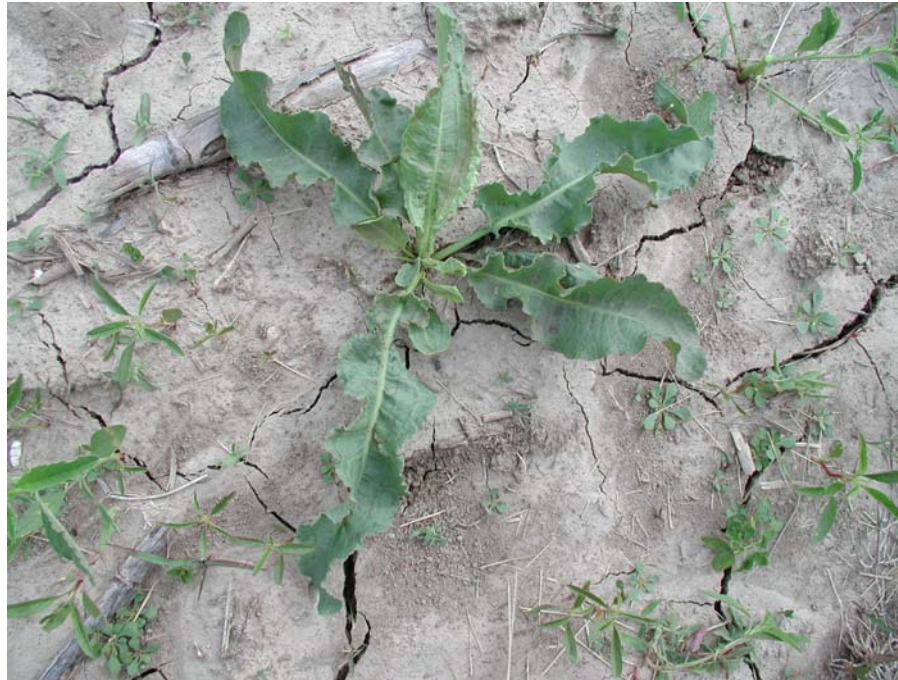
Rosette. Key characteristics: leaf margins are wavy and an ocrea is present. Leaves begin to show purple coloration.