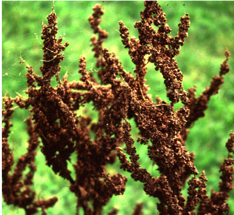
Mature seedheads are rust-colored.