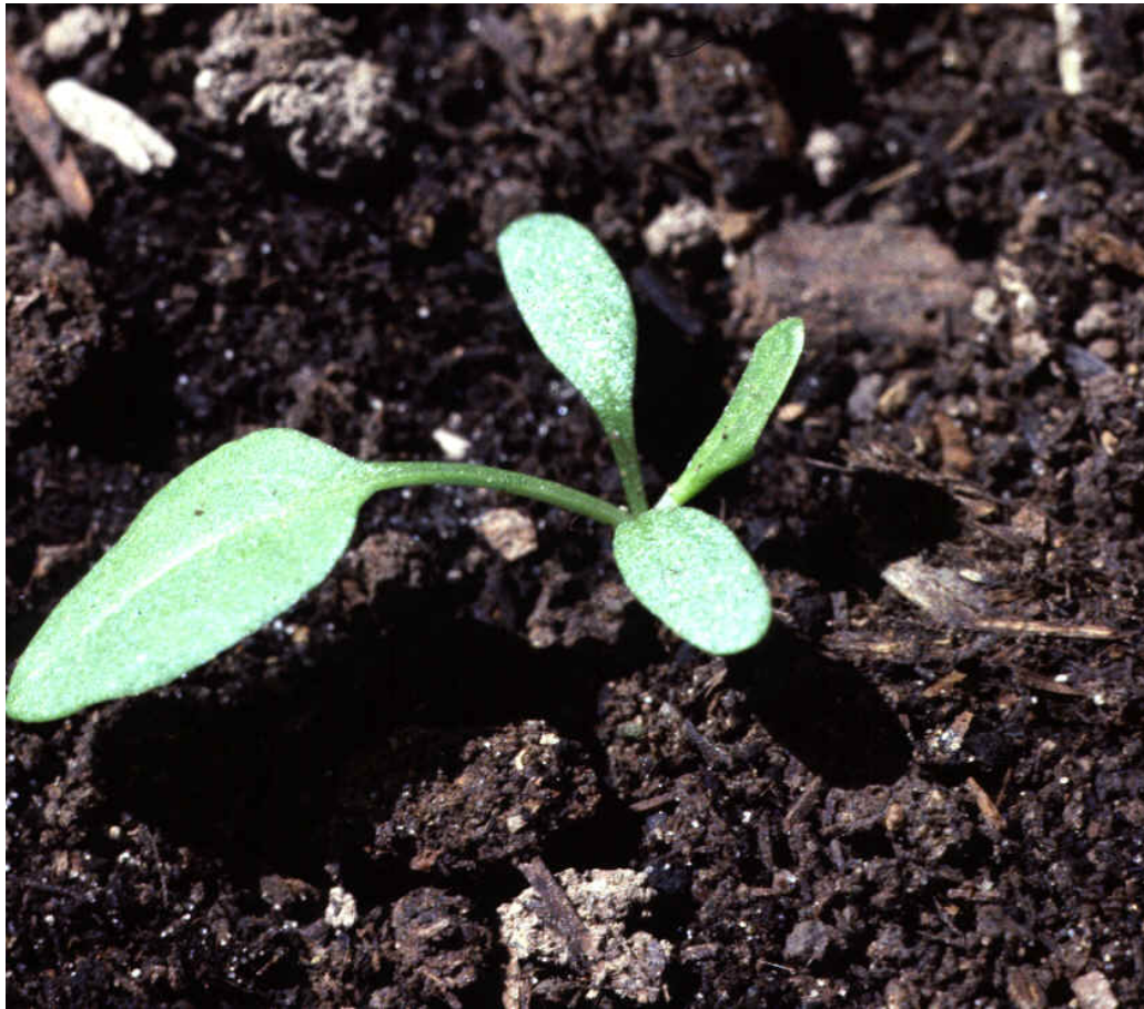
Seedling. Key characteristics: cotyledons are smooth and spatula-shaped.