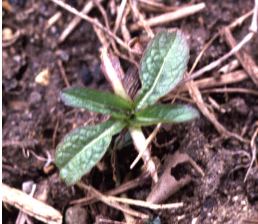
Seedling. Basal rosettes are formed during the first year of growth.