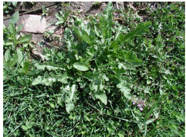
Basal rosettes. Key characteristics: leaf surfaces have a coarse appearance and prominent white midvein.