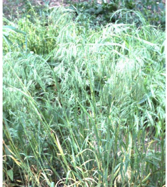
Stands of Downy Brome.