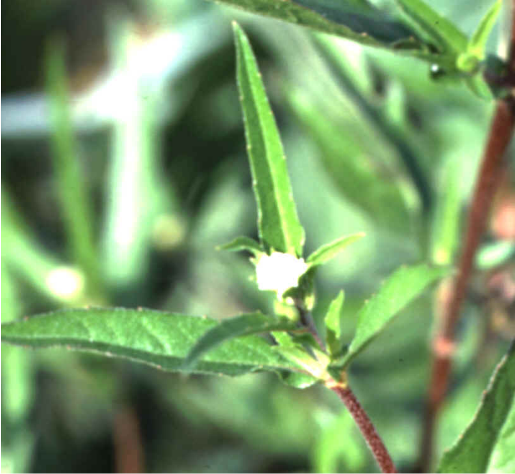
Flower. Small, white and produced in the terminals and leaf axils.