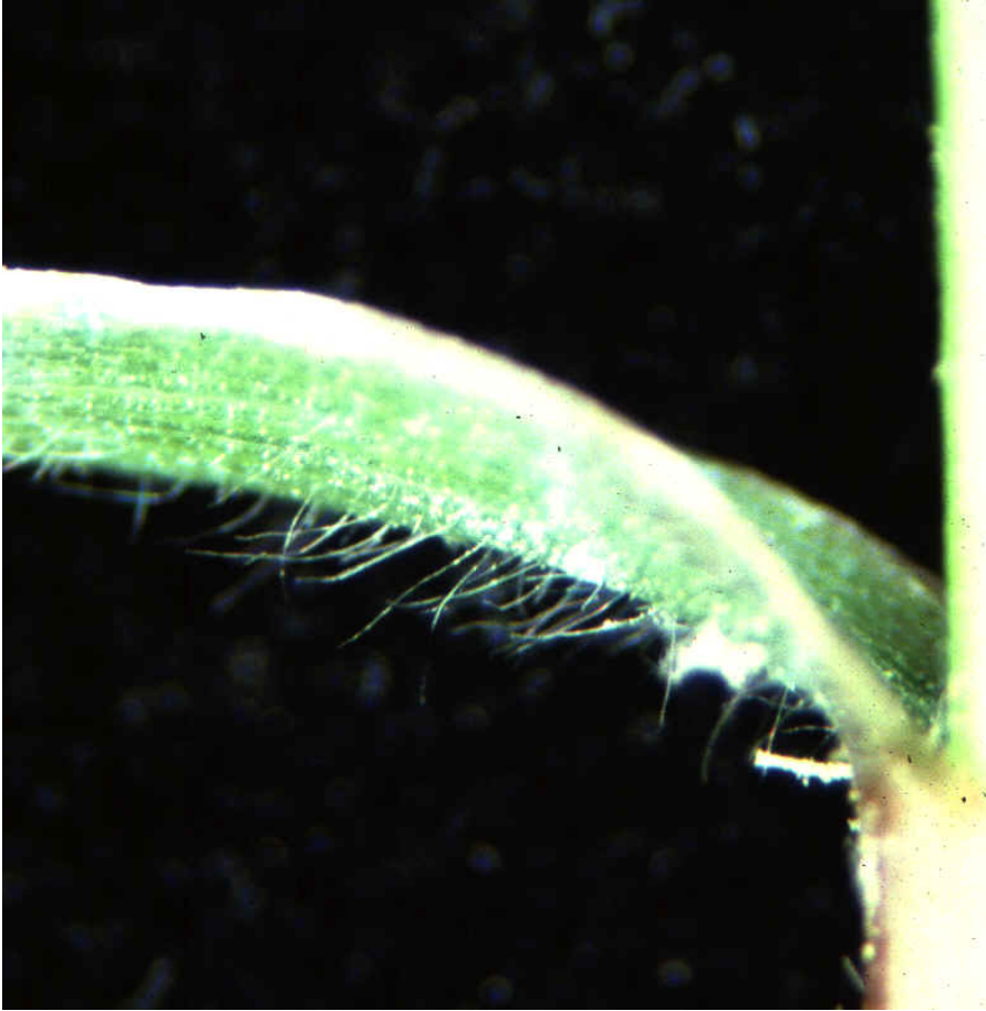
Seedling plant. Key characteristics: first leaf may have hair on the bottom surface.