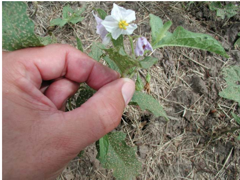
Flowering plant. Key characteristics: flowers range in color from white to purple and have 5 petals.