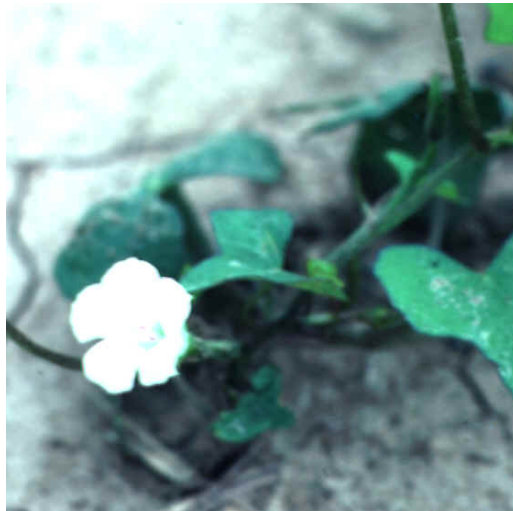
Flower. Key characteristics: white and smaller than other morningglory species.