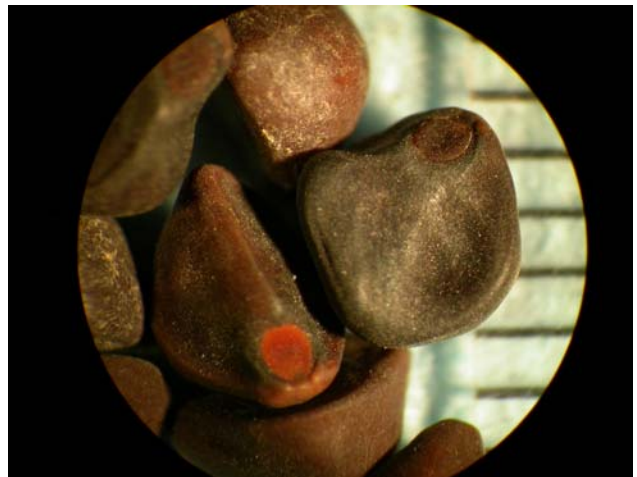
Seed. Seed are 3-sided with 2 flattened sides and one round side. Color is brownish black and the length is 3.0 to 4.0 mm.