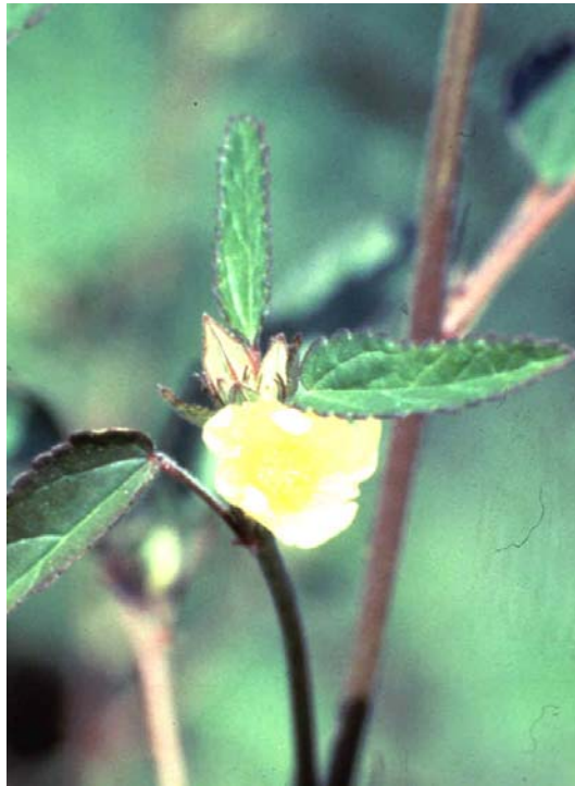
Flower. Key characteristics: produced in the leaf axils, are pale yellow and have 5 petals.