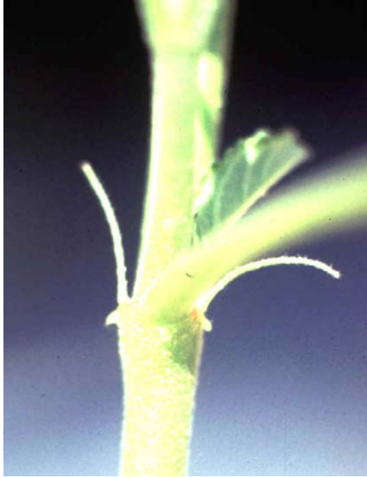
Stem. Key characteristics: fleshy stipules are located at the base of the petioles.