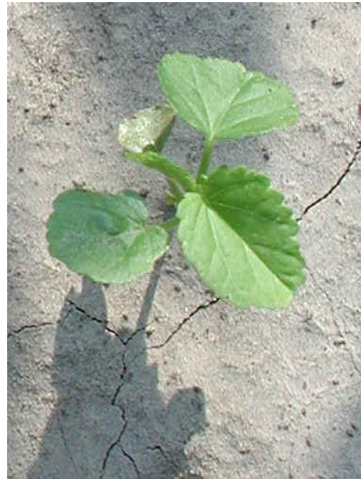
Vegetative plants. Key characteristics: leaves are alternate and the margins are serrated.