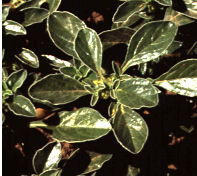
Vegetative plant. Key characteristics: leaves are tightly bunched, glossy and smooth.