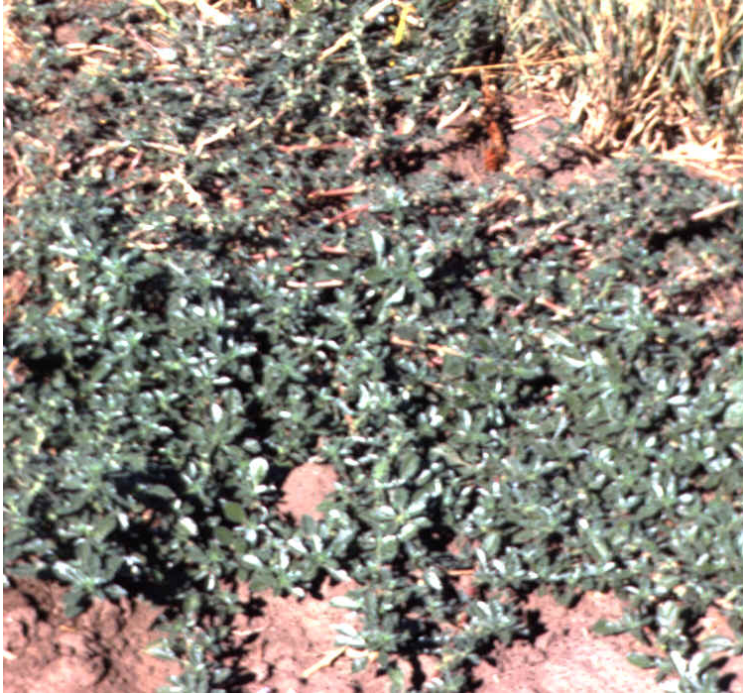
Growth habit. Prostrate pigweed is a sprawling, mat-forming summer annual.