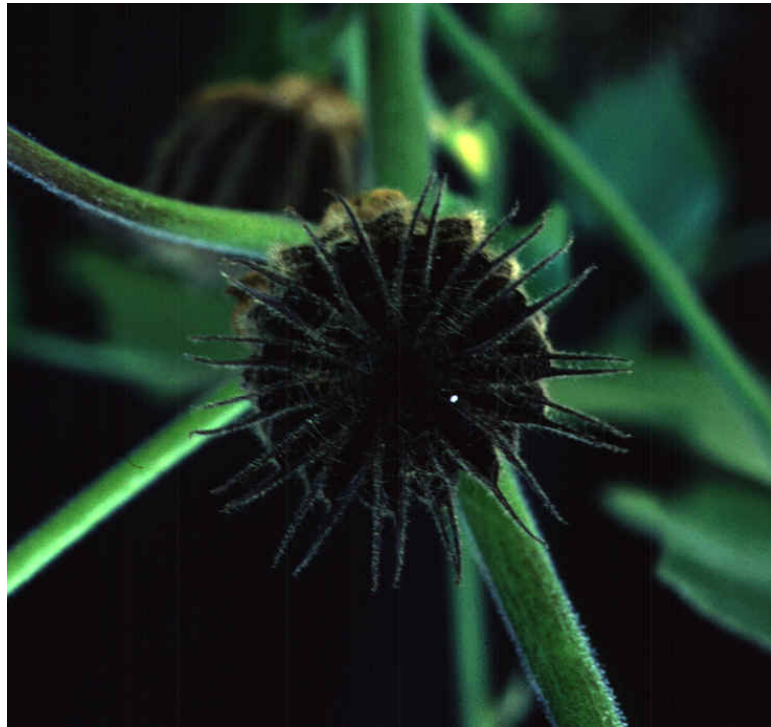
Fruit. Key characteristics: cup-shaped which contains 9 to 15 compartments, each containing seed.