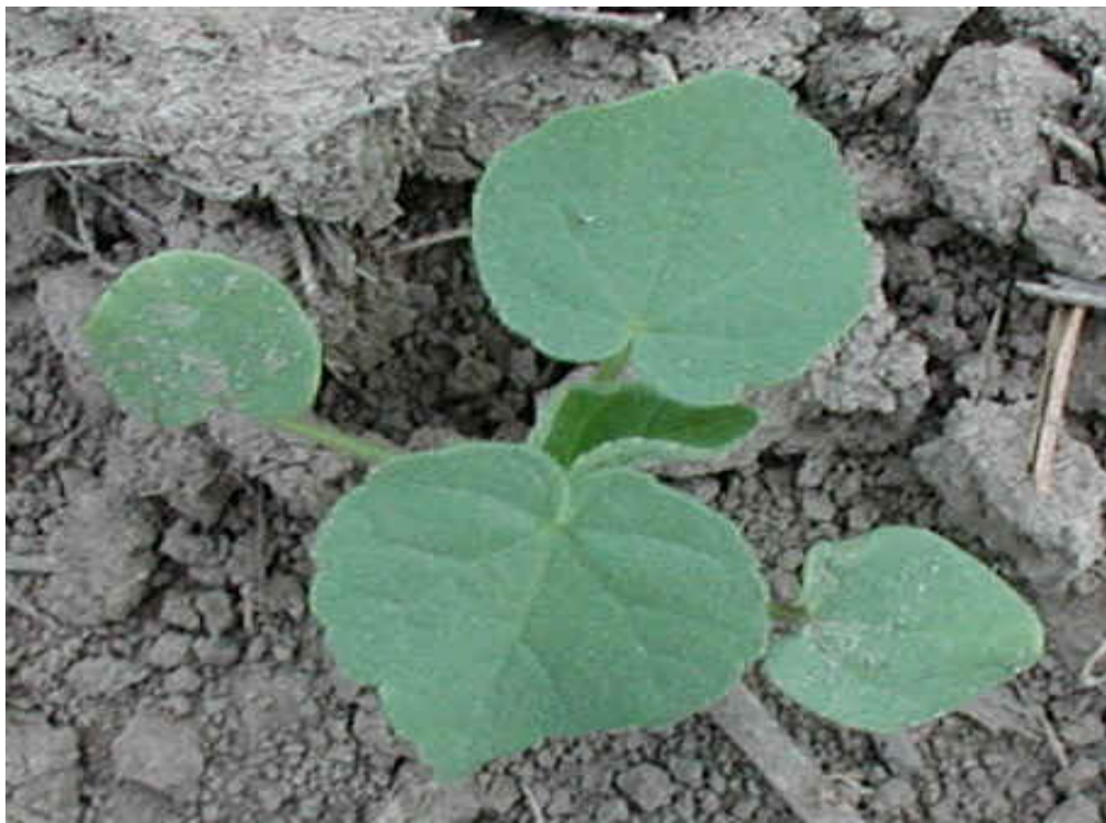
Cotyledons and first leaves. Key characteristics: densely hairy, one cotyledon is rounded while the other is more or less heart-shaped. Leaves are alternate and contain some teeth.