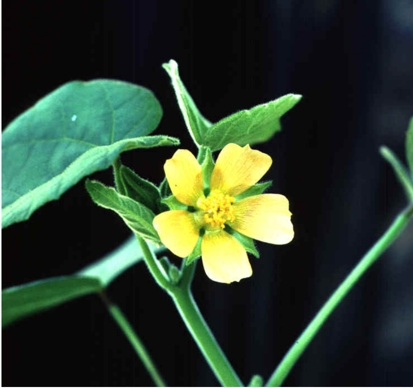
Flower. Key characteristics: yellow-colored and have 5 petals.