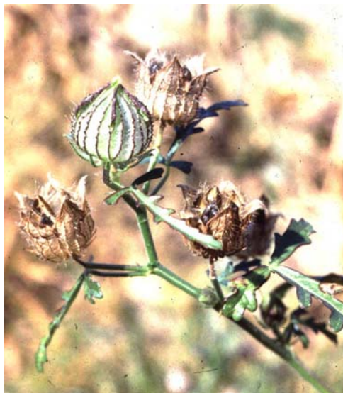
Fruit have the appearance of hot-air balloons.