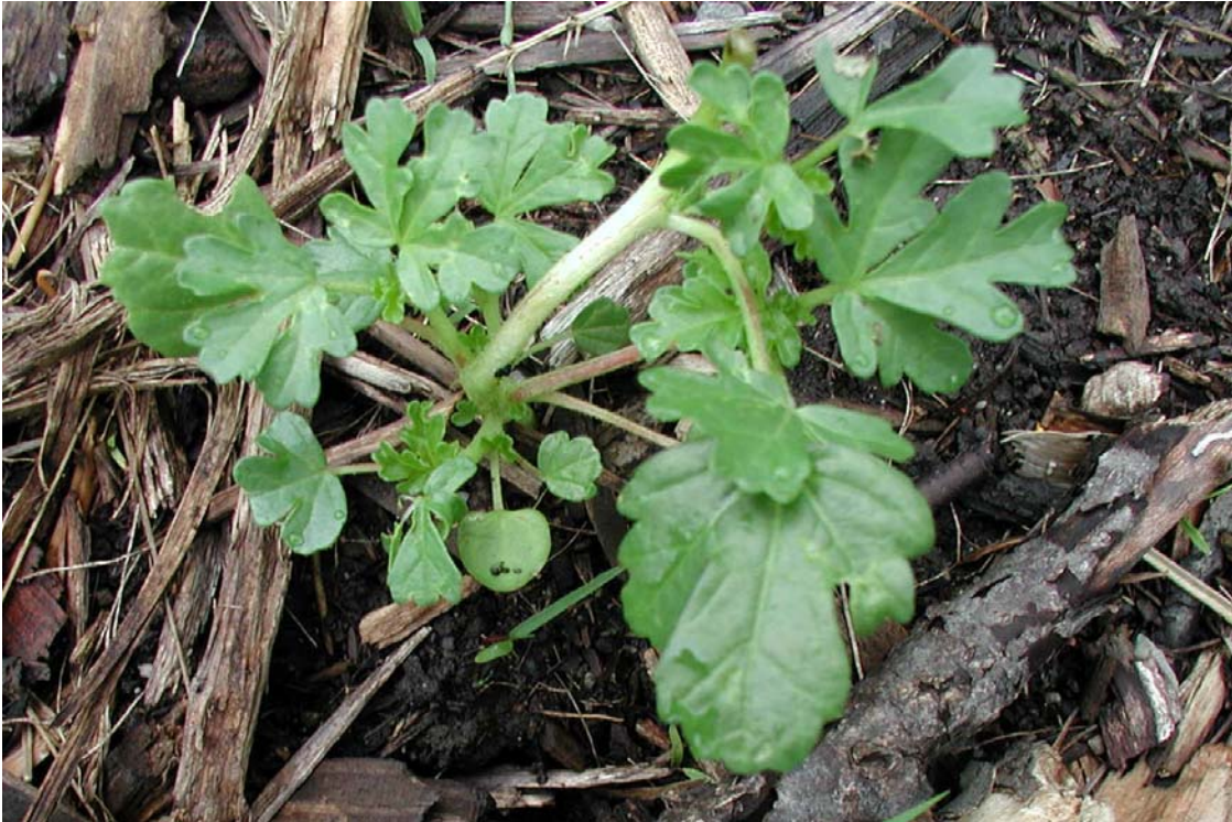
Seedling. Leaves are usually distinctly 3-lobed (sometimes 5) and alternate.