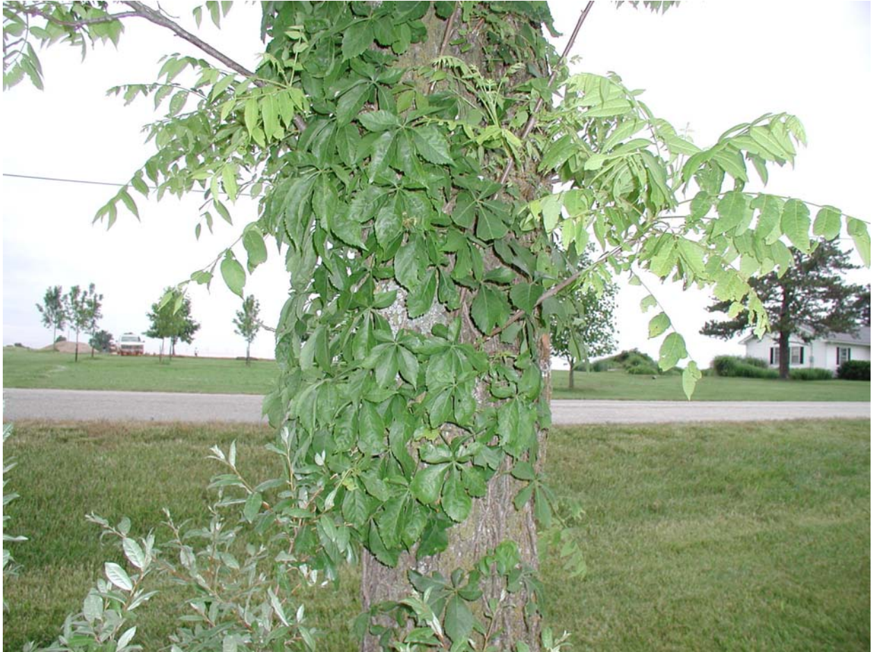
Virginia creeper climbs over objects that are in its path.